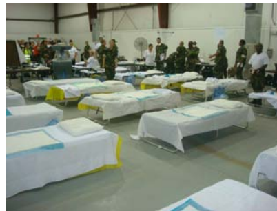
Ft. A.P. Hill Field Medical Station